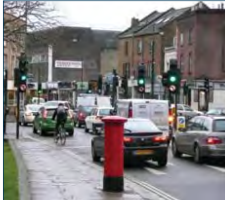
Traffic congestion in the rush hour

In March, several of the largest employers in Teddington attended an event to learn about Transport for London's 'A new way to work' programme that helps organisations promote sustainable travel options to their staff.