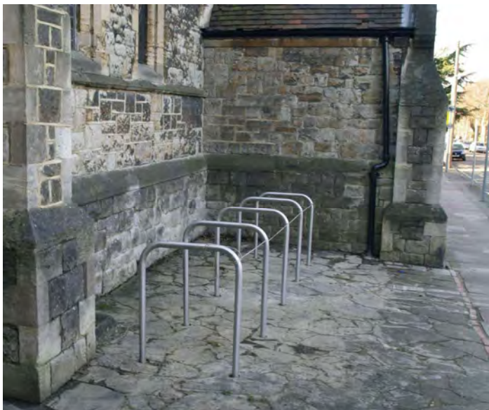
St Paul's received free cycle stands as part of the Enterprise workplace travel plan offering