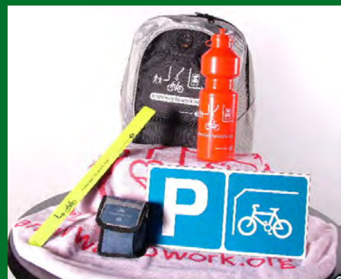
A selection of the practical tools available free from Enterprise to encourage cycling amongst staff; cycle repair kits, rucksacks, reflective slap wraps, signage and water bottles.