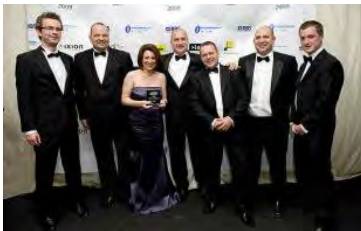
Chequers receiving the Best Business for Sustainability award at the RBS South London Business Awards, May 2009.

An expert Enterprise travel planner worked with Chequers to gain an understanding of their business and employee travel requirements, in order to provide a tailor-made travel plan for the company.